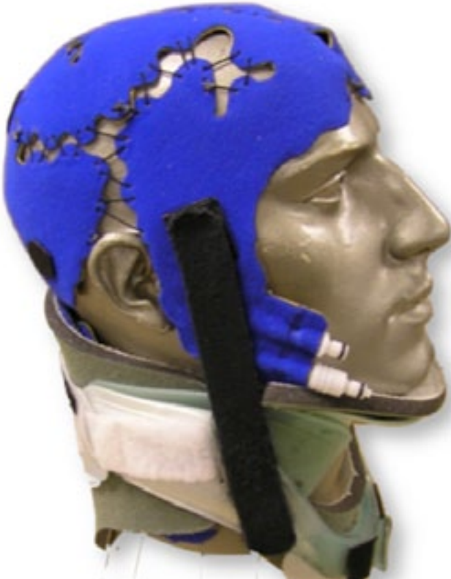
A cooling helmet developed as a spin-off from NASA technology will soon be ready for experimental testing at Beckman’s Biomedical Imaging Center and in the field.